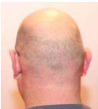
Shrek Newsletter Editor