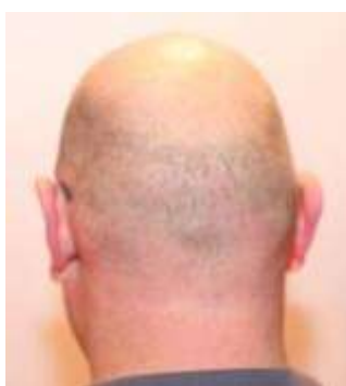
Shrek Newsletter Editor