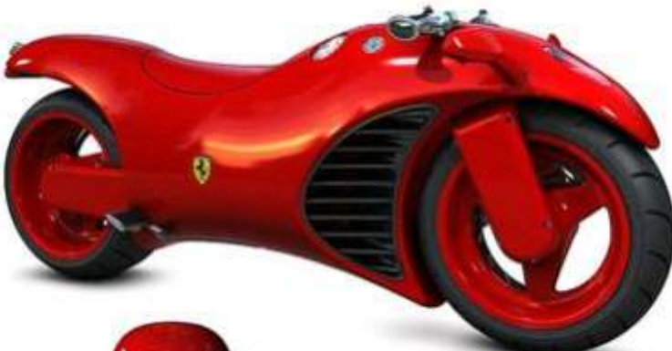
A Ferrari Motorcycle????

"No" she replies, "I'm your son's English Teacher."