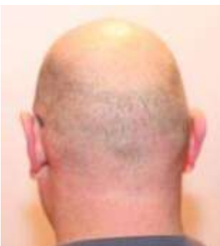
Shrek Newsletter Editor