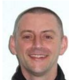
Marc Ford Clothing