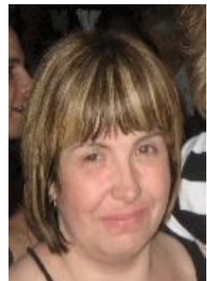
Sue Ellis Web Site